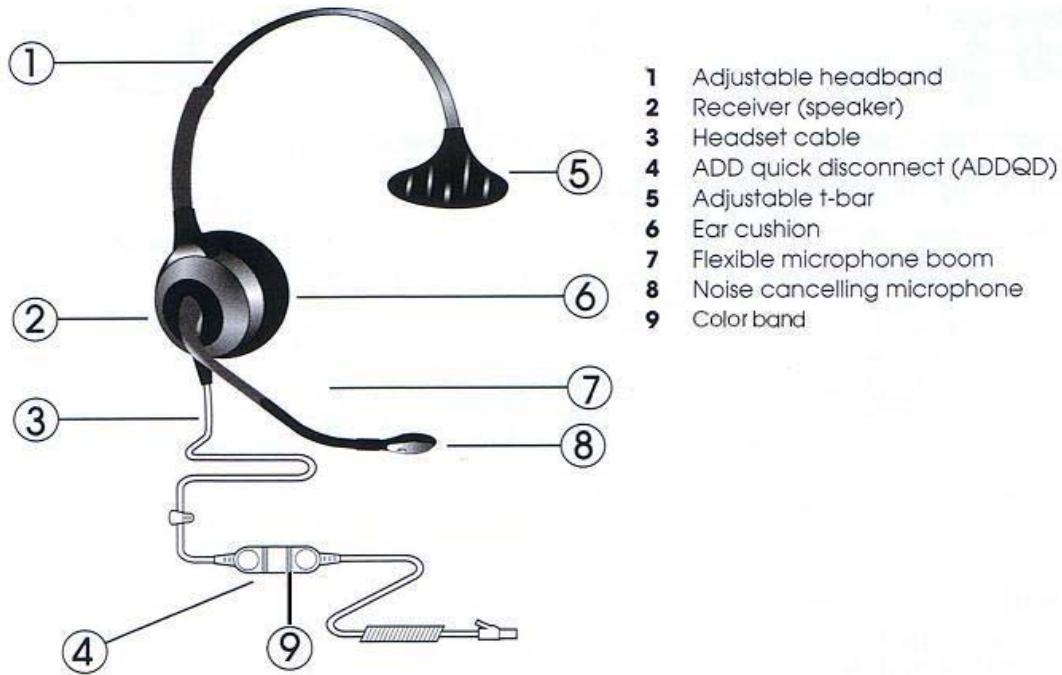
Figure 2. Addcom ADD-800 Performance Plus II Headset