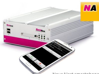
NovaAlert smartphone app and NovaBox