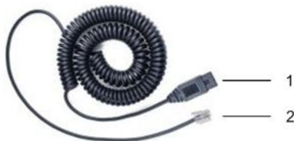
VXi 1026V Direct Connect cord

The VXi UC ProSet headsets connect to the quick disconnect end of the 1026V cord. The modular end of the 1026V connects to the Headset jack of the Avaya 1400 Series Telephone. The functionality of the headset is controlled by the individual buttons on the 1400 telephone set. No additional configuration is required.